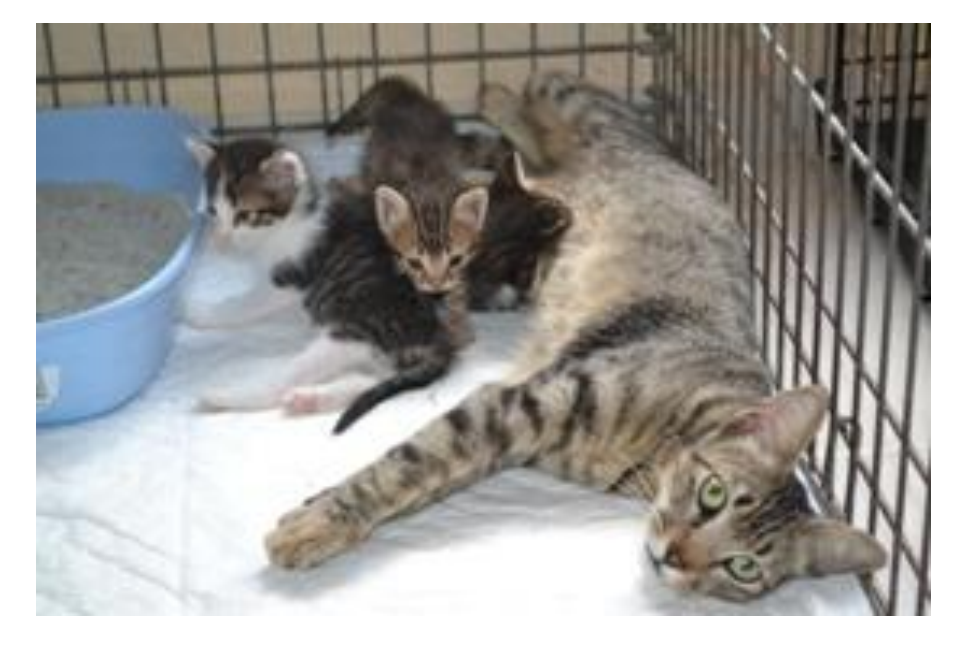
Mama cat with three little male kittens, about four weeks