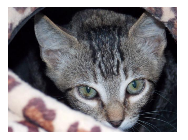
Hickory, male six months