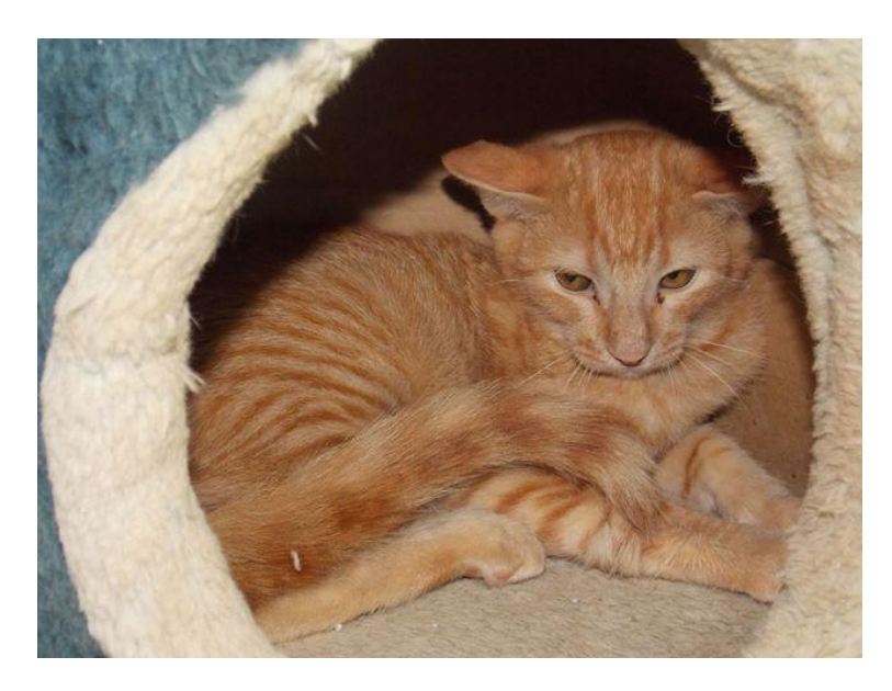
Wynn, male 10 months

WEEKLY to deliver litter, medicines and other supplies to foster parents.