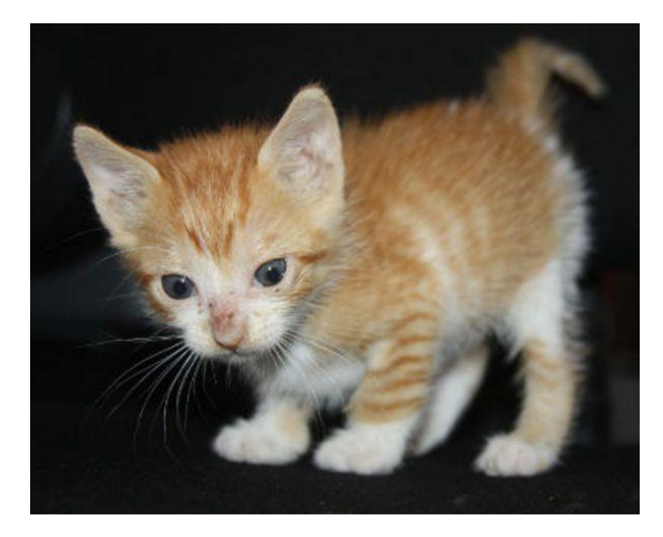
Little Foot, male six weeks