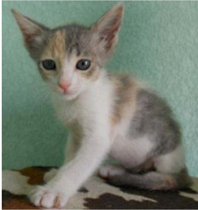
Cami, female two months

WEEKLY to deliver litter, medicines and other supplies to foster parents.