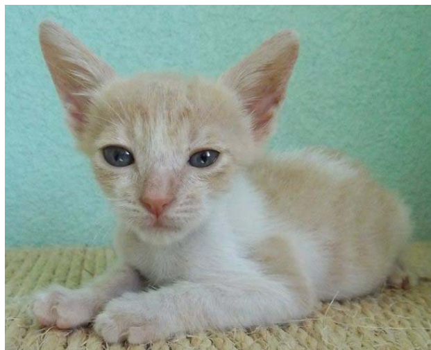
Kevin, male two months