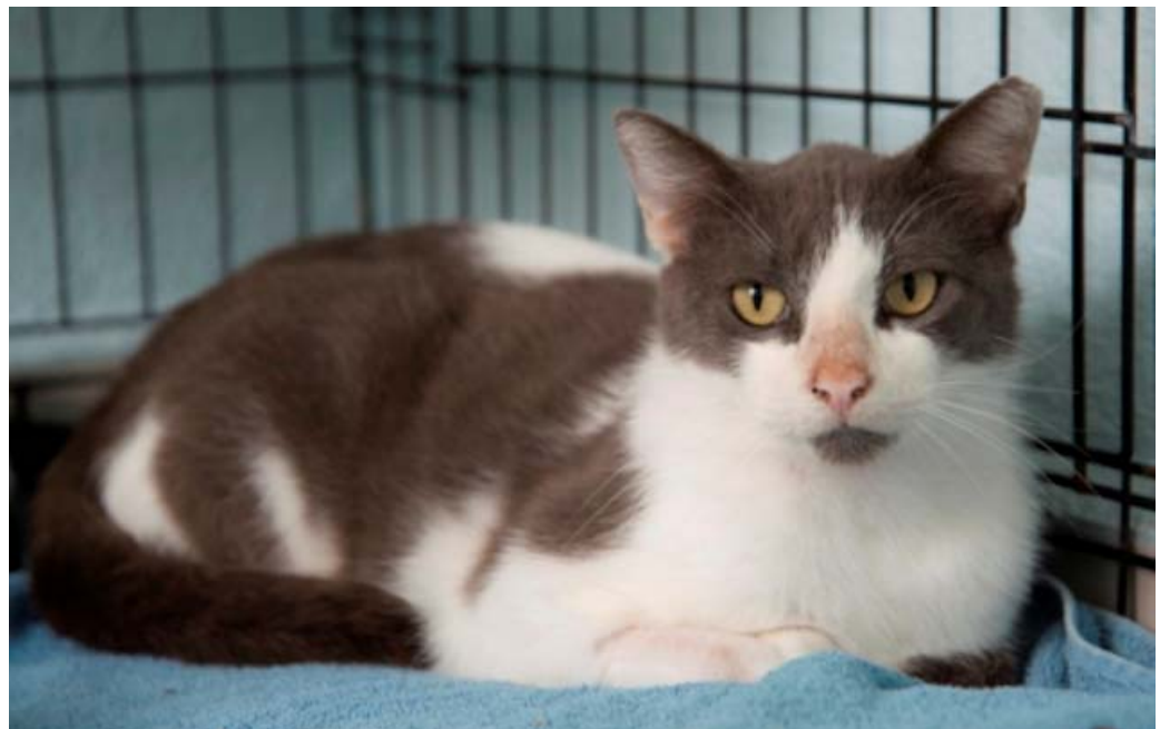
Matias, adult male

Matias, below, is a special needs adult cat who is still looking for that special home. He had stones that blocked his bladder and needed surgery to construct a hole in his abdomen to allow him to urinate. He still uses a litter box, but has a minor leakage issue. Matias also needs Royal Canine urinary food too. If you have a separate space to house him and don't mind a bit of extra laundry, you could give sweet Matias a home. Are you able to help this special needs boy?