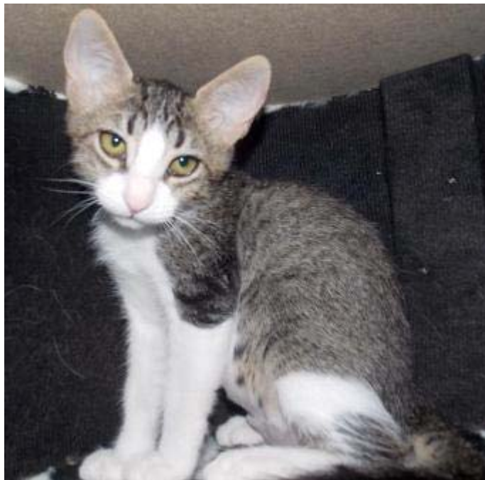
Ashley, female three months