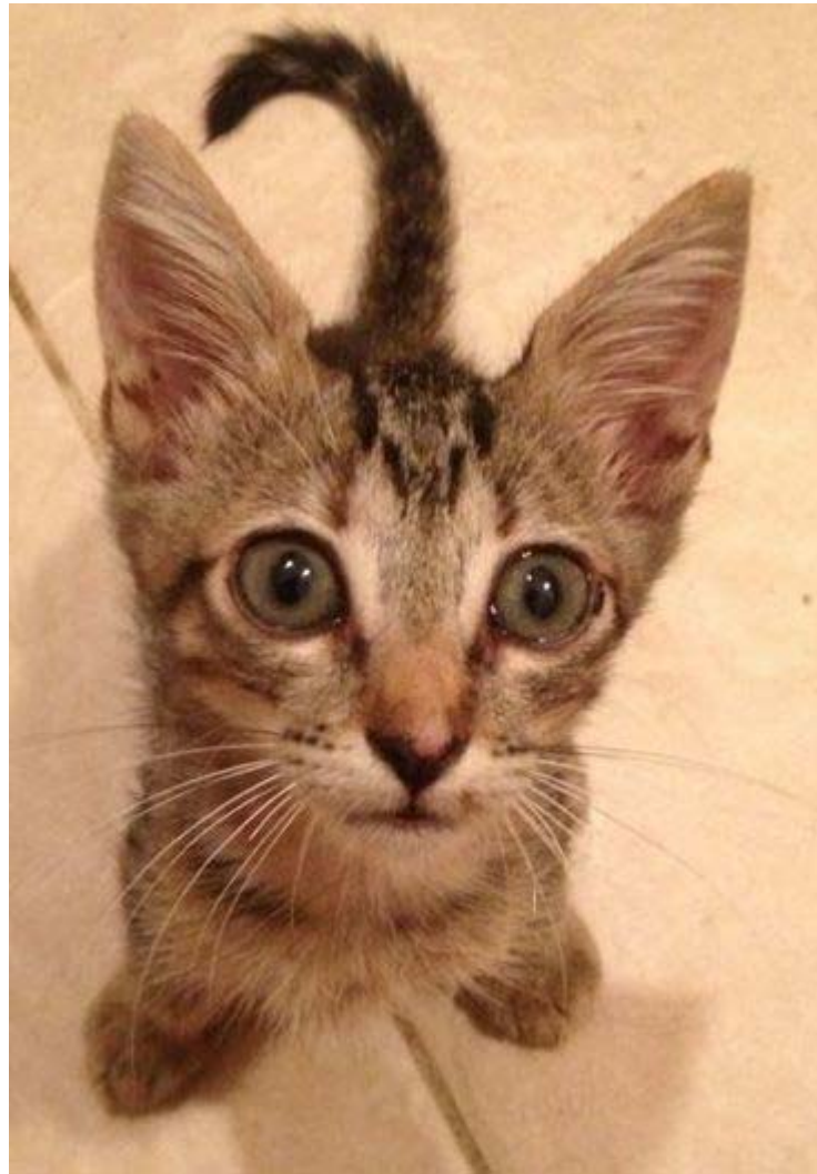
Rapunzel, female two months