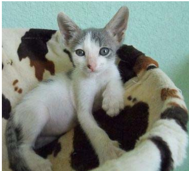
Jonny, male two months