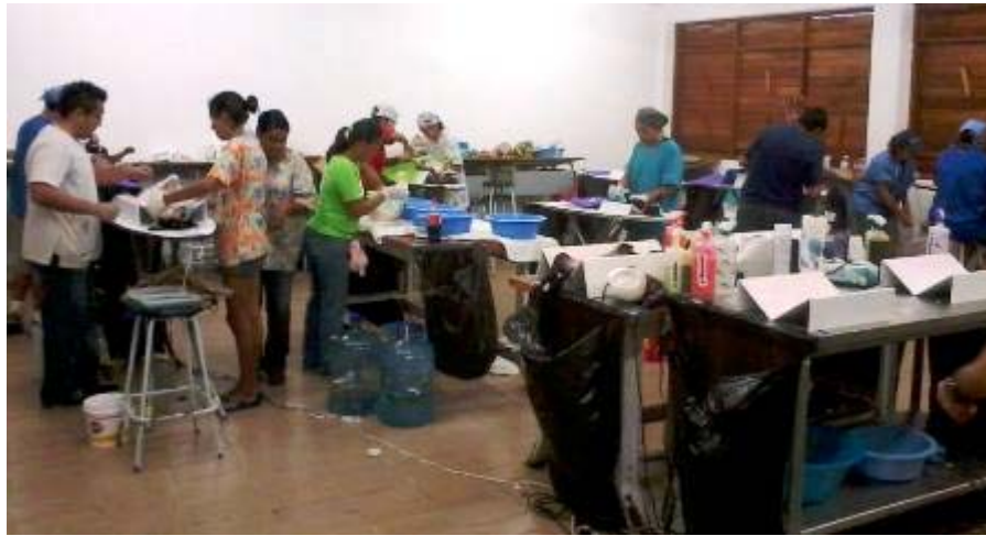
The operating room