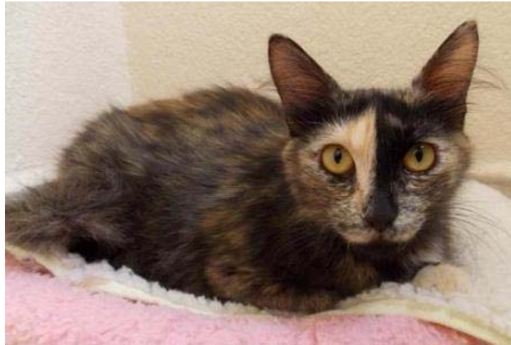
Emma, adult female