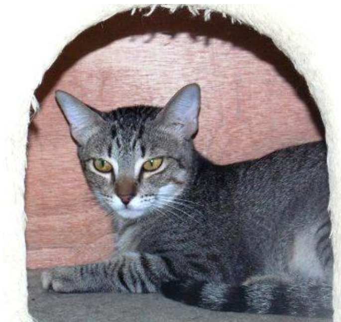
Kike, male 10 months