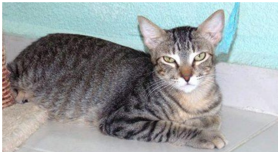
Hickory, male ten months