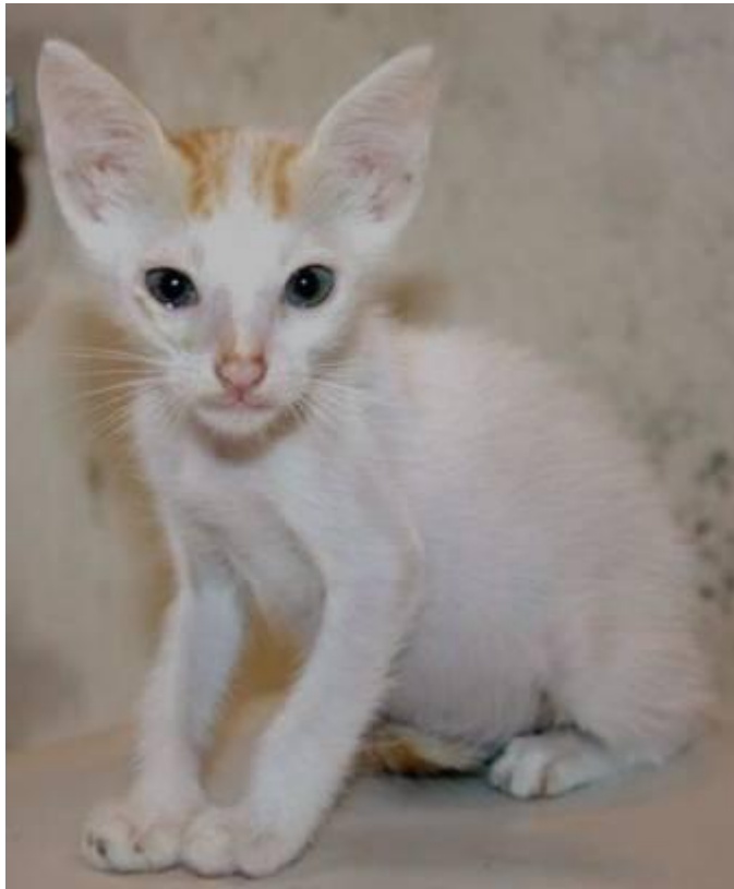
Trooper, male two months