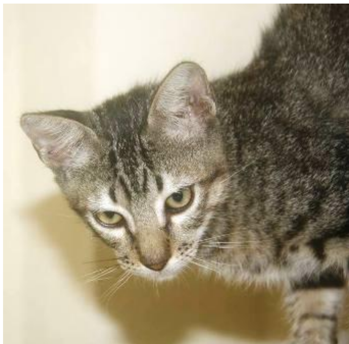
Mollette, male four months