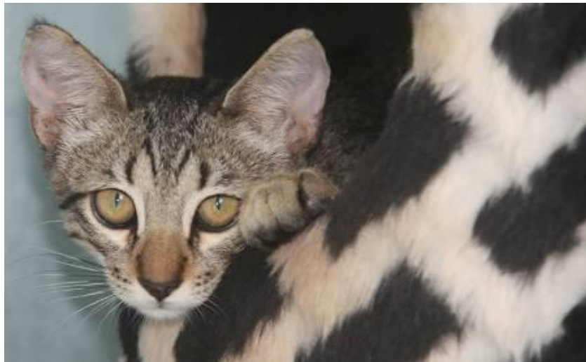
Chaquile, male four months