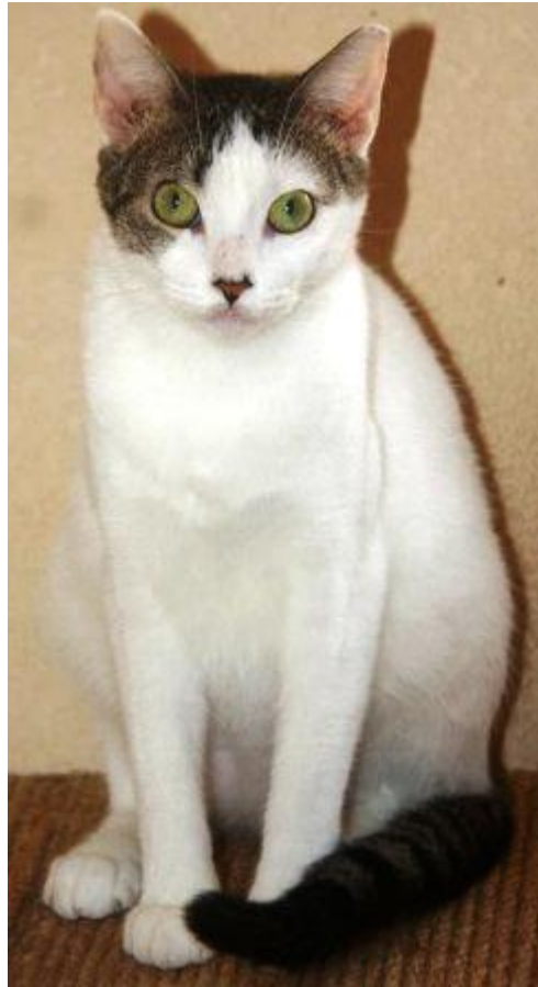
Papitas, female 10 months

WEEKLY to deliver litter, medicines and other supplies to foster parents.