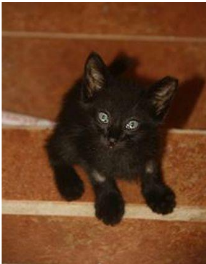
Obama, male two months